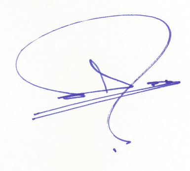
Pour LA RÉPUBLIQUE ARABE D'ÉGYPTE: