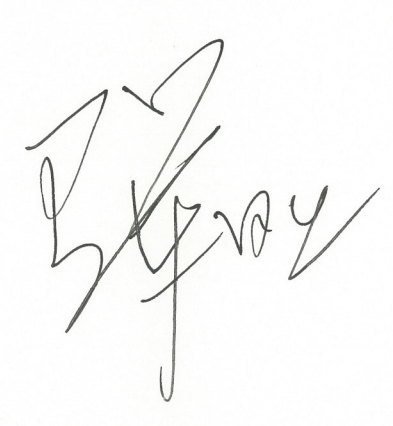
Pour LA RÉPUBLIQUE POPULAIRE DE CHINE: